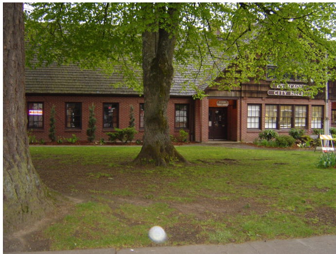
Old Library—note neon library sign at left